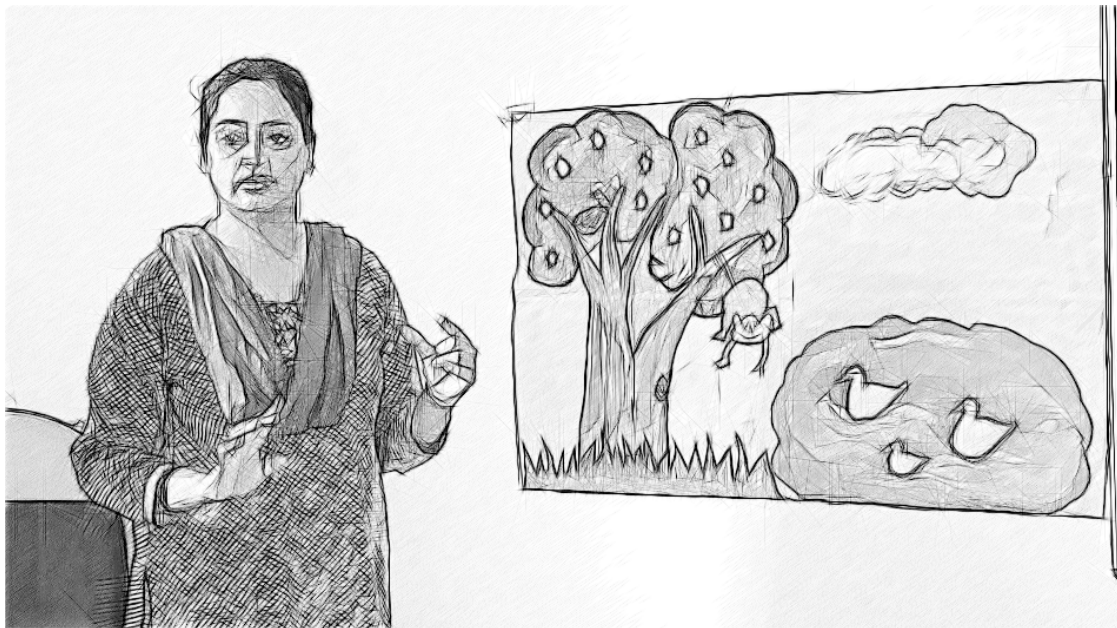
Figure 1 Using pictures to help the students identify words.

You could use pictures to help the students identify and learn the words in English (Figure 1).