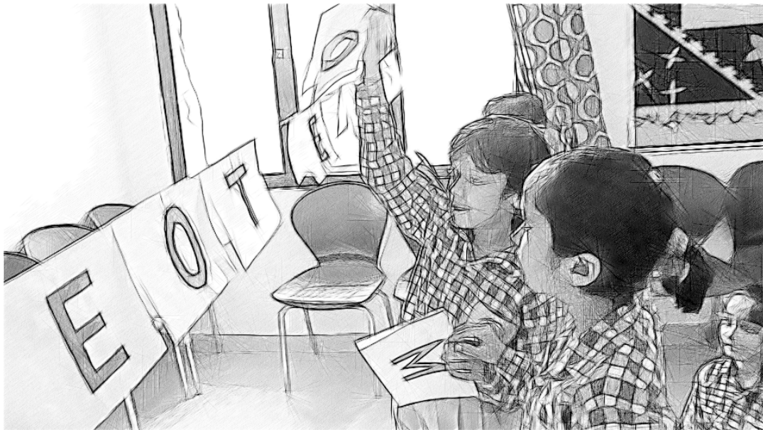
A letter card activity.

Do your chosen activity with students. Afterwards, think about what went well, and what you could do differently next time.