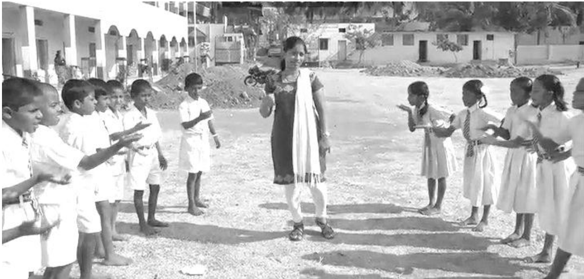
Figure 1 You can do this activity outside the classroom, with the students in a large circle or in two lines.

Do you notice any students who have difficulty distinguishing rhyming patterns and rhyming words? Make a note of this – it may indicate a hearing impairment.