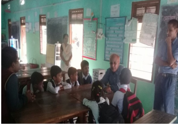
Children enjoying interaction with the writer

Class wise and gender wise Enrolment is given below: