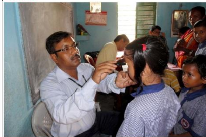
World Health Day

• After recess, health checkup of the students and persons concerned with the school will be done in association with local Primary Health Centre.