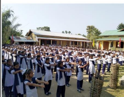
Child Protection Day

22 nd March: On the occasion of World Water Day, awareness on conservation of water will be created by talks delivered by the students selected beforehand to speak on the occasion. Posters/ wall charts/ slogans etc. prepared by the students will be exhibited.