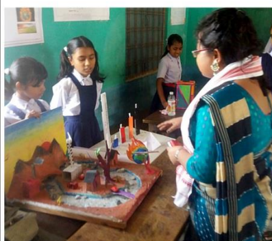
National Science Day

28 th February: National Science Day will be observed by organising science exhibition in the school.